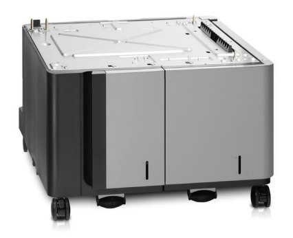
HP LaserJet 3500 sheet HCI and Stand (C3F79A)

<sup>1</sup> HP Auto-On/Auto-Off Technology capabilities subject to printer and settings; may require a firmware upgrade.