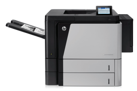
HP LaserJet Enterprise M806dn Printer

This HP LaserJet handles big print jobs fast, with extra-large input capacity and versatile paper-handling options. Mobile printing is simple with wireless direct printing and touch-to-print technology. Easy upgrades protect your investment.<sup>1, 2</sup>