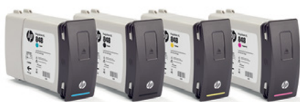
8 HP PageWide XL ink cartridges (2 x 400-ml per color with auto-switch)

The HP PageWide XL 5000 Printer series includes a stationary 40-inch (101.6-cm) printbar that spans the whole printing width. As paper moves under the printbar, the entire page is printed in one pass, enabling very high printing speeds.